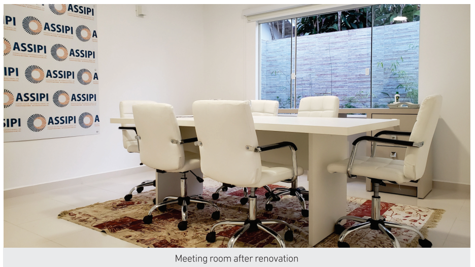
Meeting room after renovation