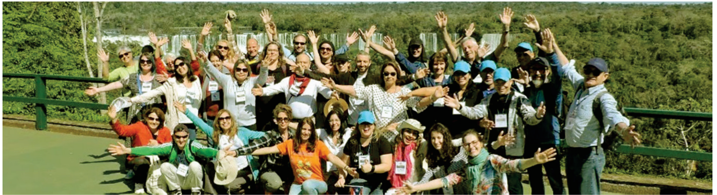
Foreign students test bioenergies at Iguazu Falls

Newsletter of the International Cosmoethical Conscientiological Community