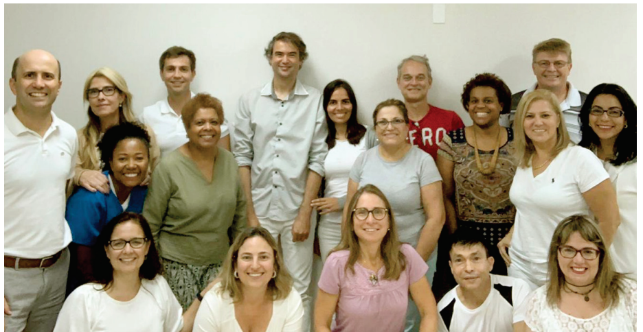
Assipi and Relendentia Partnership in Portugal