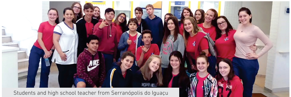
Students and high school teacher from Serranópolis do Iguaçu