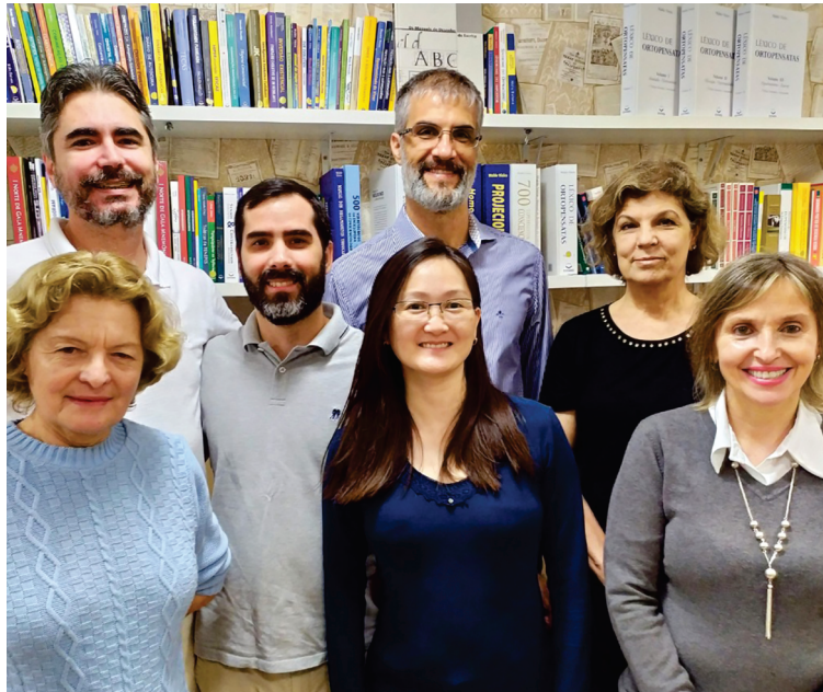
Some volunteers of Editares

Currently, the group is made up of about 15 volunteers and has the collaboration of dozens of experts who assist in the review of the works. "It's a small group of volunteers who work hard to keep up with the growing flow of publi-