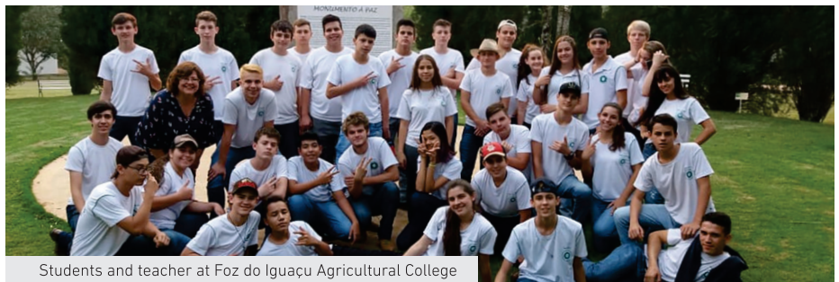
Students and teacher at Foz do Iguaçu Agricultural College