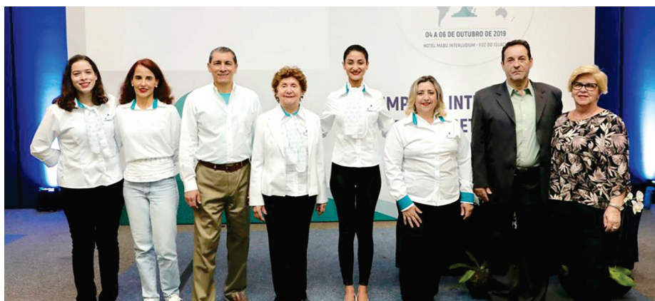
Team of volunteers working at the Symposium

The Symposium featured 13 speakers, 11 articles published in the journal, a mentalsomatic circle on the subject, and, in the pre-event week, debate of verbetes by Cosmoethos volunteers and Symposium speakers. The Cosmoethos team evaluated that this first Symposium helped clarify the concept of democracy, making it possible to broaden its theoretical conception with a view to detailing the aspects that intertwine the regime of democratic government and Cosmoethics aiming to increasingly qualify its exercise, focusing on the installation of the Cosmoethical World State in the future.