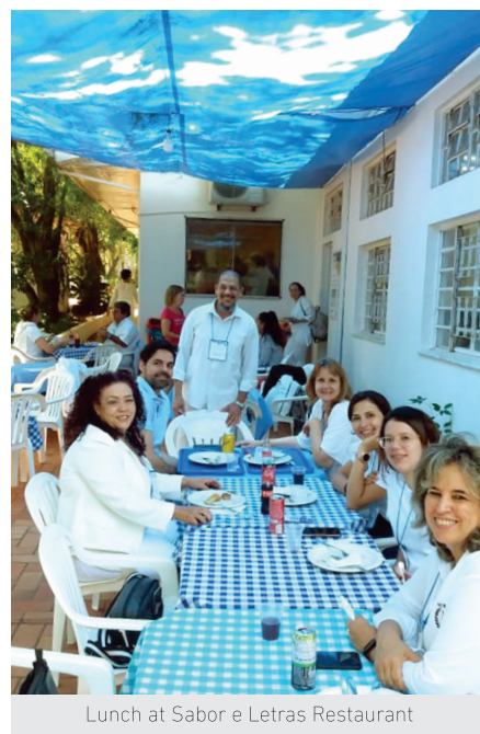
Lunch at Sabor e Letras Restaurant

The inter-cooperation and integration among the institutions involved was relevant to the success of the course that will have a new edition in 2021, aiming for major reurbanisations.