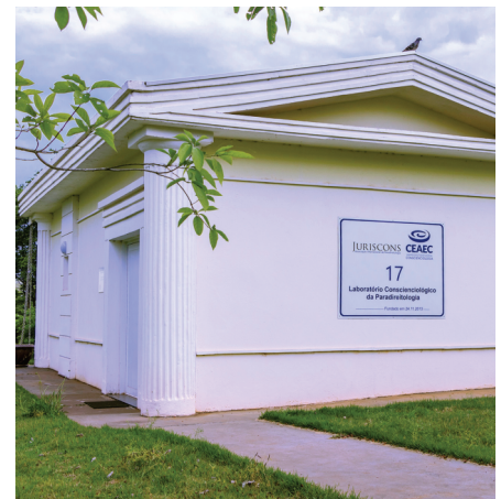
Paradireitology Laboratory - Campus CEAEC

More information on this service and activities can be obtained on the website www.juriscons.org or on WhatsApp +55 (45) 99111-6263.